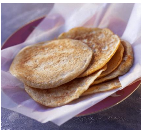
from "On Morality: A Carnival Tale" a short story by Anton Chekhov, 1886

Court Counselor Semyon Petrovitch Podtikin sat down at the table, spread a napkin across his chest, and quivering with impatience, awaited the moment the blini would appear...Finally, the cook arrived with the blini. At the risk of scorching his fingers, Semyon Petrovich snatched up two of the hottest from the top of the pile and slapped them onto his plate with gusto. The blini were crisp, lacy, and as plump as the shoulders of a merchant's daughter. Podtikin smiled affably, hiccupped with pleasure, and doused the blini in hot butter. Then, as if to tease his appetite, luxuriating in anticipation, he slowly, deliberately heaped them with caviar. He poured sour cream over the places the caviar left bare. Now he had